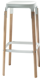
Seat + Foot-rest: White 5108 Legs: Natural Beech