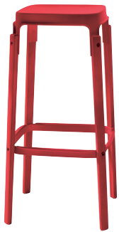
Seat + Foot-rest: Red 5083 Legs: Beech painted Red