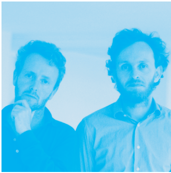
Ronan & Erwan Bouroullec

Ronan and Erwan Bouroullec have been working together for about ten years now. Their collaboration is a permanent dialogue, nourished by their distinct personalities and a shared notion of diligence, with the intention to achieve greater balance and refinement. The Bouroullecs have been working with Magis since 2004, designing two complete furniture collections as well as other projects. These days, Ronan and Erwan Bouroullec design for numerous manufacturers and they also continue to carry out their own experimental activity which is essential to the development of their work at Galerie Kreo, Paris, where four exhibitions of their designs