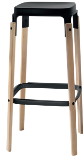
Seat + Foot-rest: Black 5140 Legs: Natural Beech