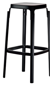
Seat + Foot-rest: Black 5140 Legs: Beech painted Black