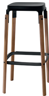
Seat + Foot-rest: Black 5140 Legs: American Walnut