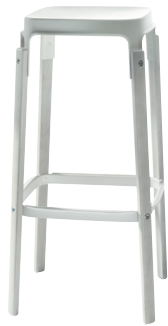
Seat + Foot-rest: White 5108 Legs: Beech painted White