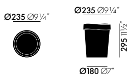
Happy Bin S