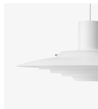
→ Matt white